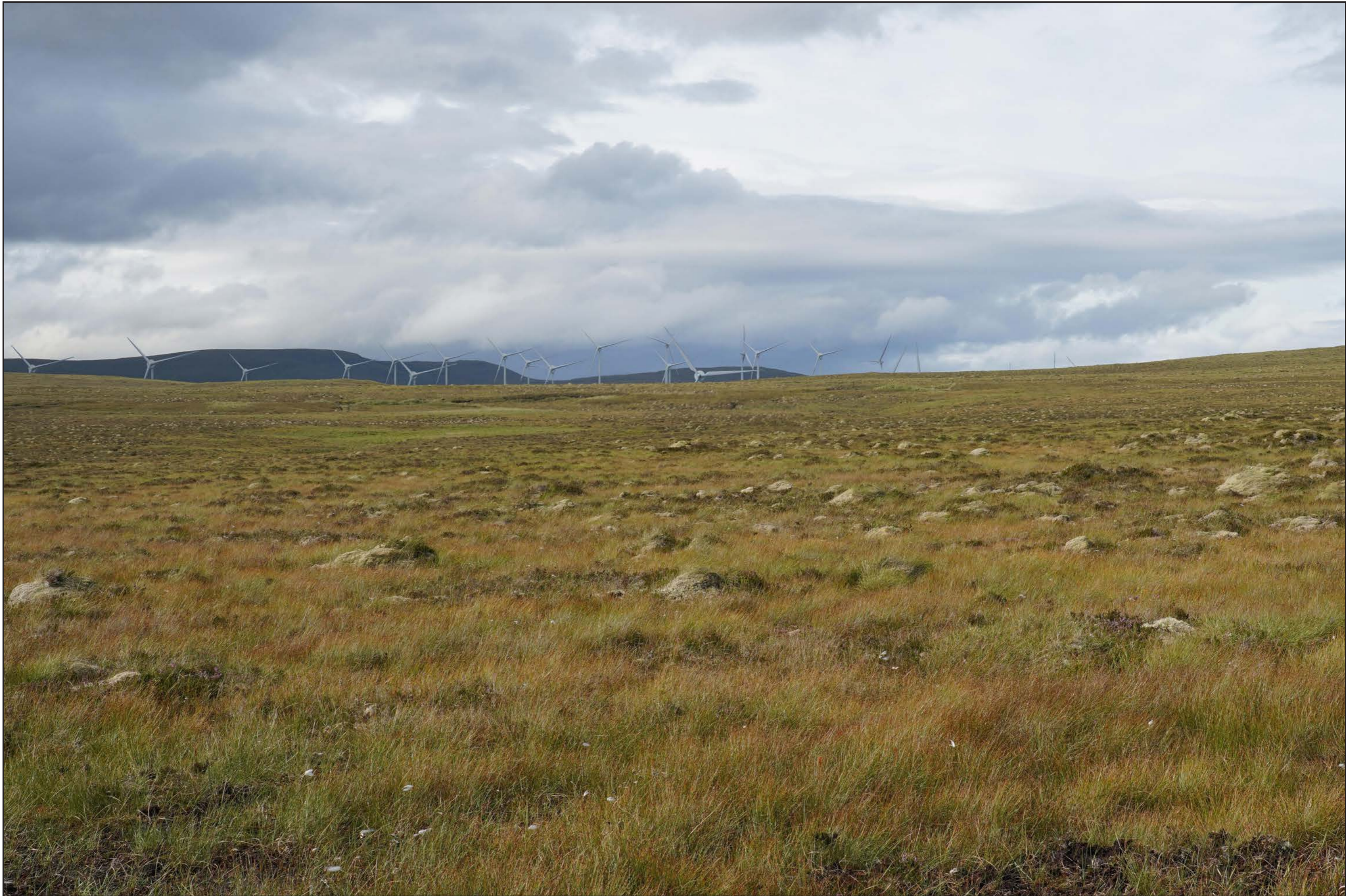
Viewpoint 18 (Fig 5.24j) The track to Loch Choire

Distance to nearest turbine: 2,609m Camera: Sony ILCE-7RM3A Focal Length: 75mm Camera height: 1.5m Date: 08/09/2022 16:34