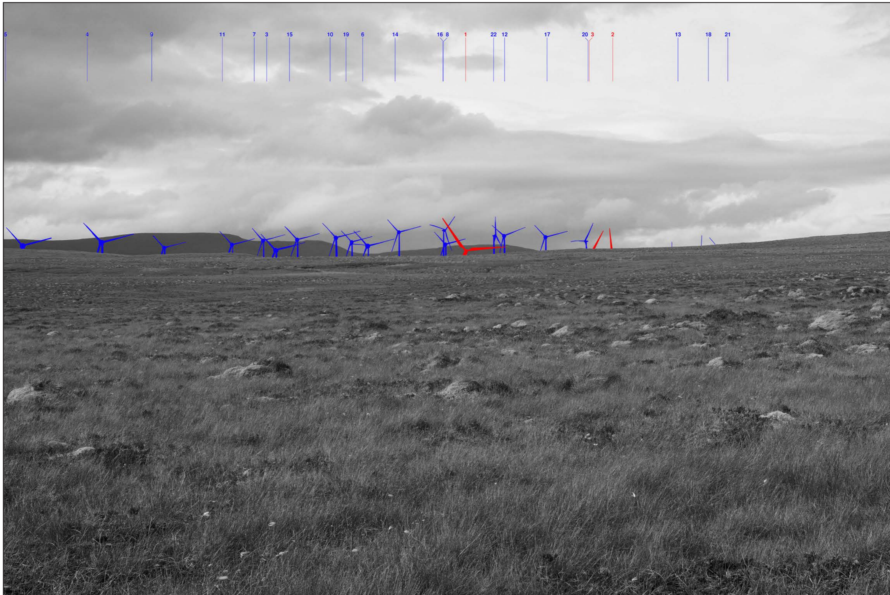
Viewpoint 18 (Fig 5.24k) - Monochrome Analysis The track to Loch Choire