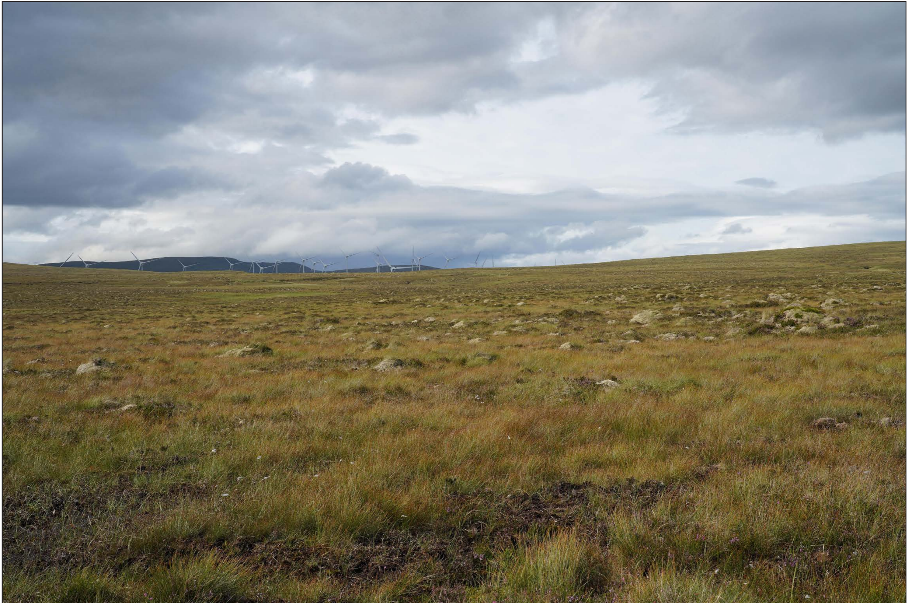
Viewpoint 18 (Fig 5.24i) The track to Loch Choire

Distance to nearest turbine: 2,609m Camera: Sony ILCE-7RM3A Focal Length: 50mm Camera height: 1.5m Date: 08/09/2022 16:34