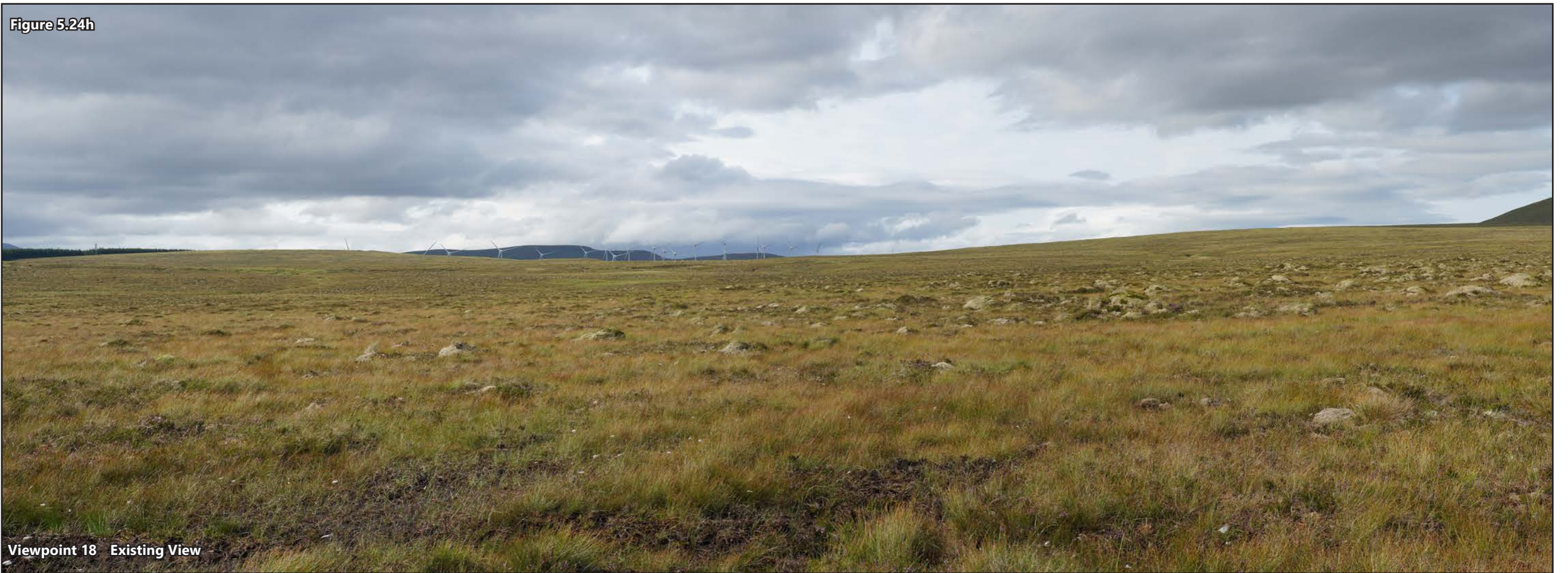
Viewpoint 18 Existing View