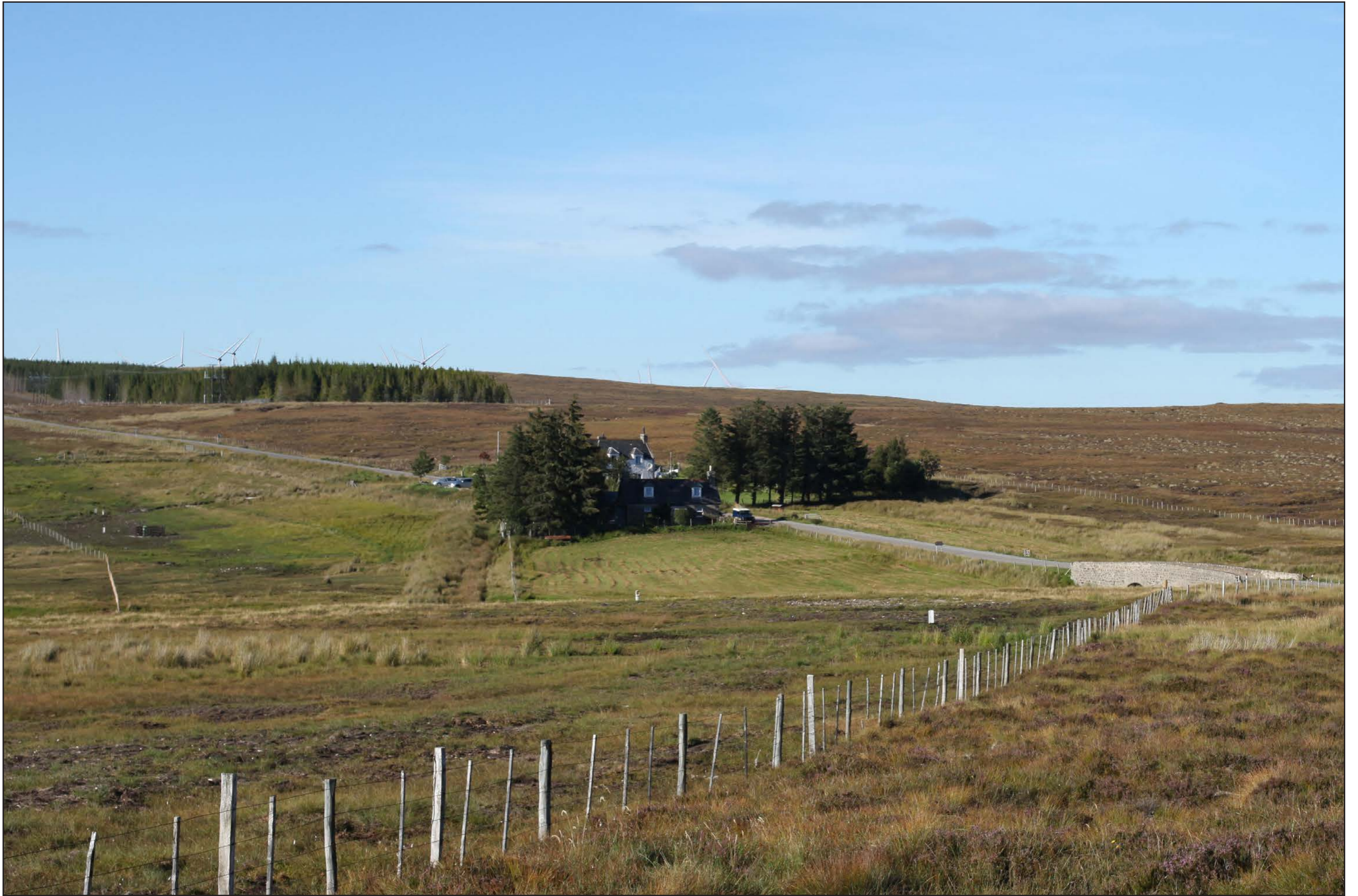
Viewpoint 17 (Fig 5.23j) A836, South of Crask Inn

Distance to nearest turbine: 2,869m Camera: Canon EOS 5D Mk2 Focal Length: 75mm Camera height: 1.5m Date: 03/08/2022 16:14