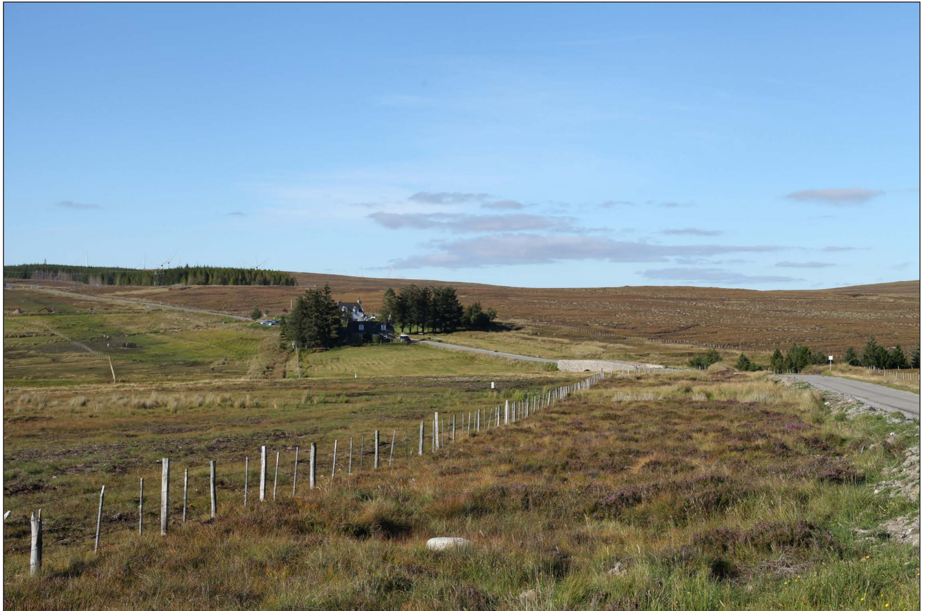
Viewpoint 17 (Fig 5.23i) A836, South of Crask Inn

Distance to nearest turbine: 2,869m Camera: Canon EOS 5D Mk2 Focal Length: 50mm Camera height: 1.5m Date: 03/08/2022 16:14