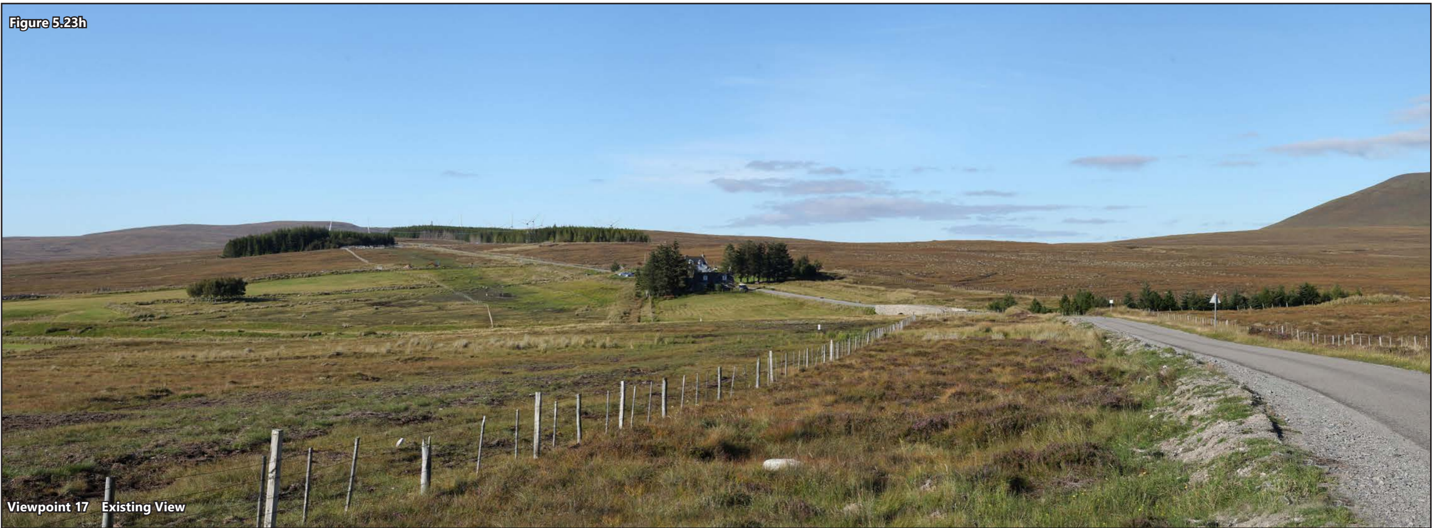
Viewpoint 17 Existing View