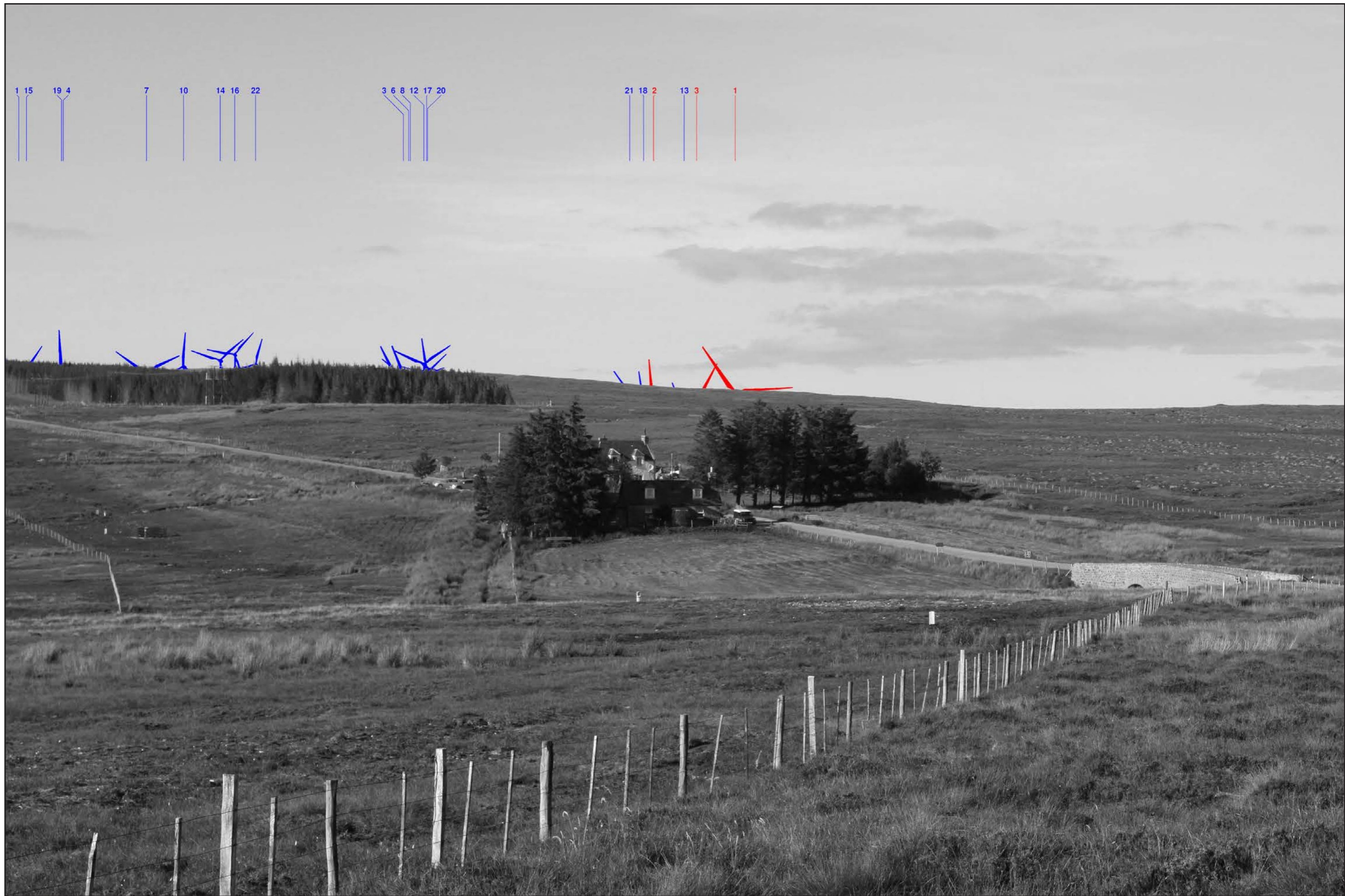
Viewpoint 17 (Fig 5.23k) - Monochrome Analysis A836, South of Crask Inn