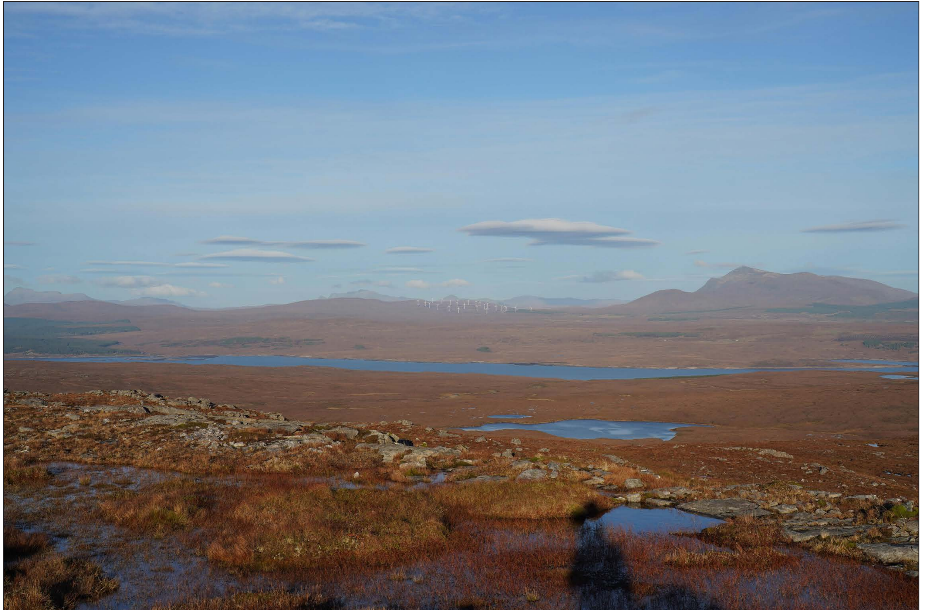
Viewpoint 13 (Fig 5.22i) Beinn Sgeireach

Distance to nearest turbine: 17,072m Camera: Sony ILCE-7RM3A Focal Length: 50mm Camera height: 1.5m Date: 17/10/2022 14:54