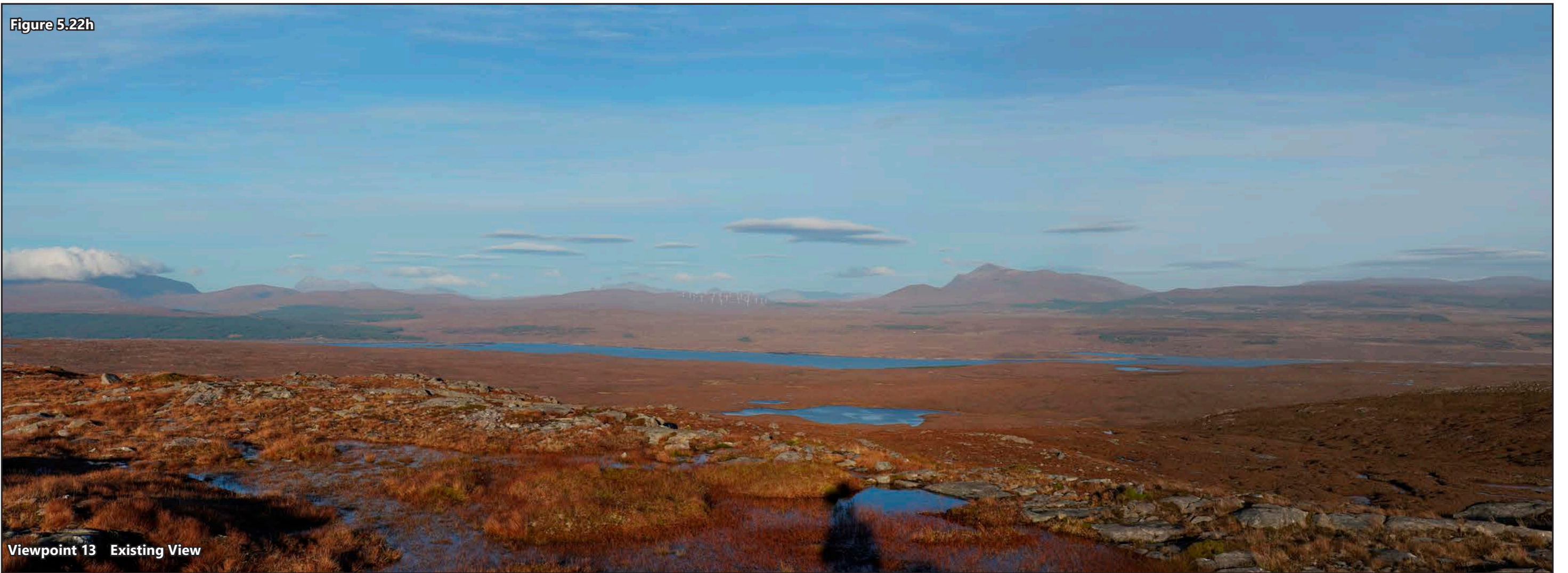
Viewpoint 13 Existing View