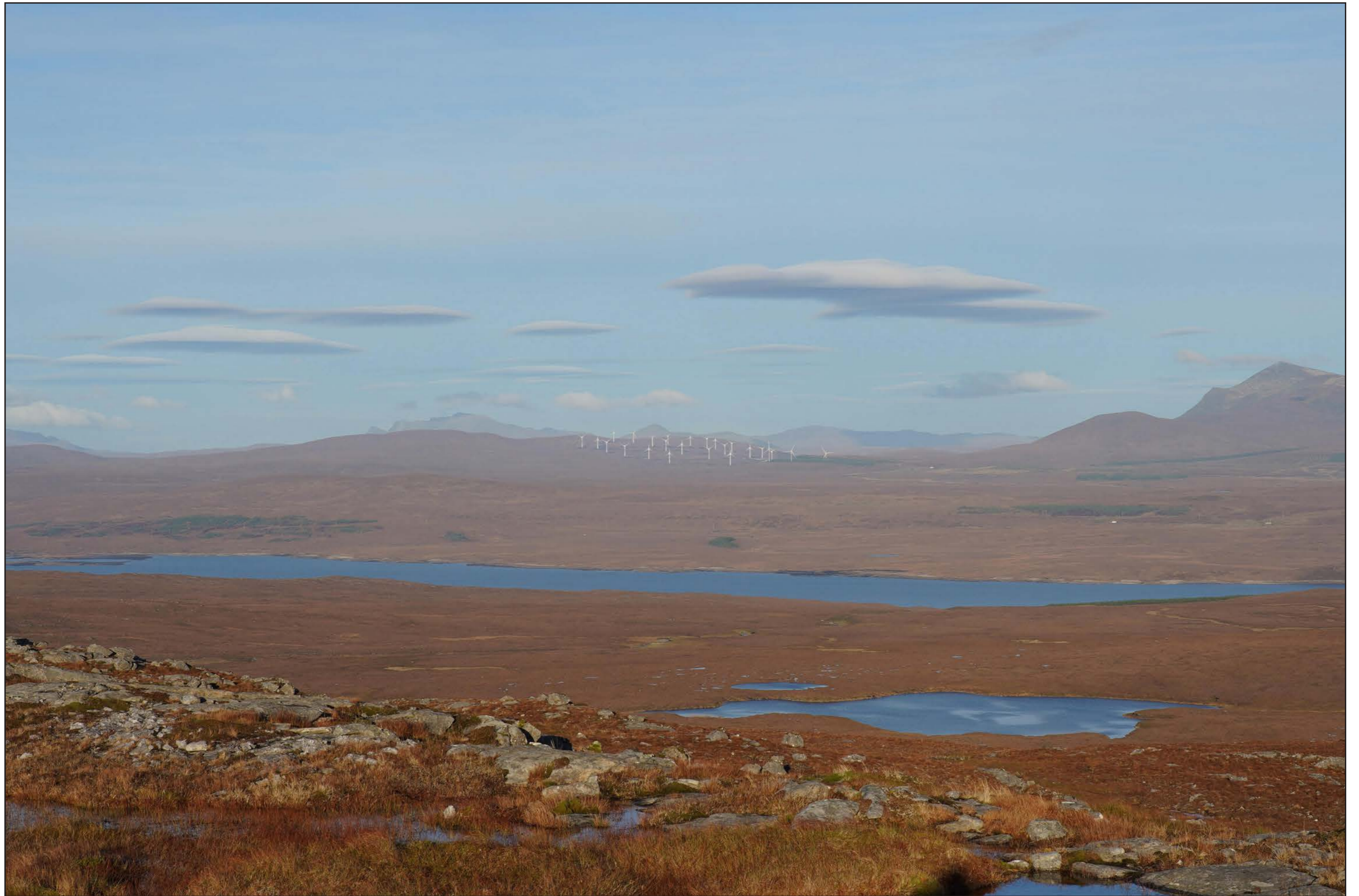
Viewpoint 13 (Fig 5.22j) Beinn Sgeireach

Distance to nearest turbine: 17,072m Camera: Sony ILCE-7RM3A Focal Length: 75mm Camera height: 1.5m Date: 17/10/2022 14:54