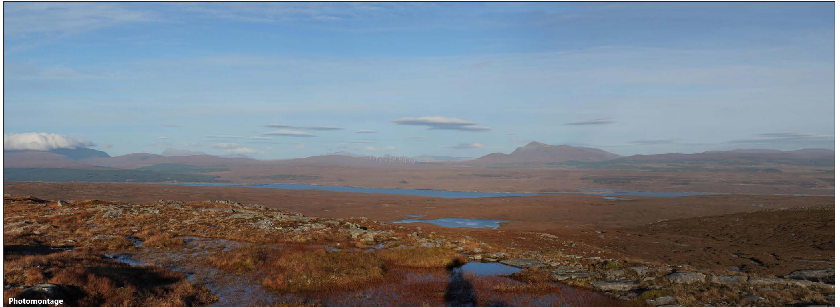
Figure 5.22g Viewpoint 13 Beinn Sgeireach

|----- Extent of 50mm single frame -----|