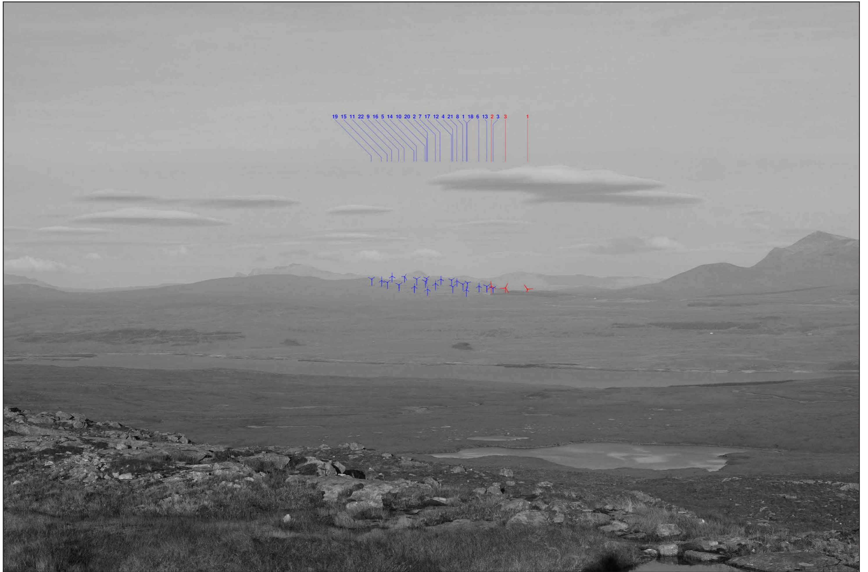
Viewpoint 13 (Fig 5.22k) - Monochrome Analysis Beinn Sgeireach

Distance to nearest turbine: 17,072m Camera: Sony ILCE-7RM3A Focal Length: 75mm Camera height: 1.5m Date: 17/10/2022 14:54