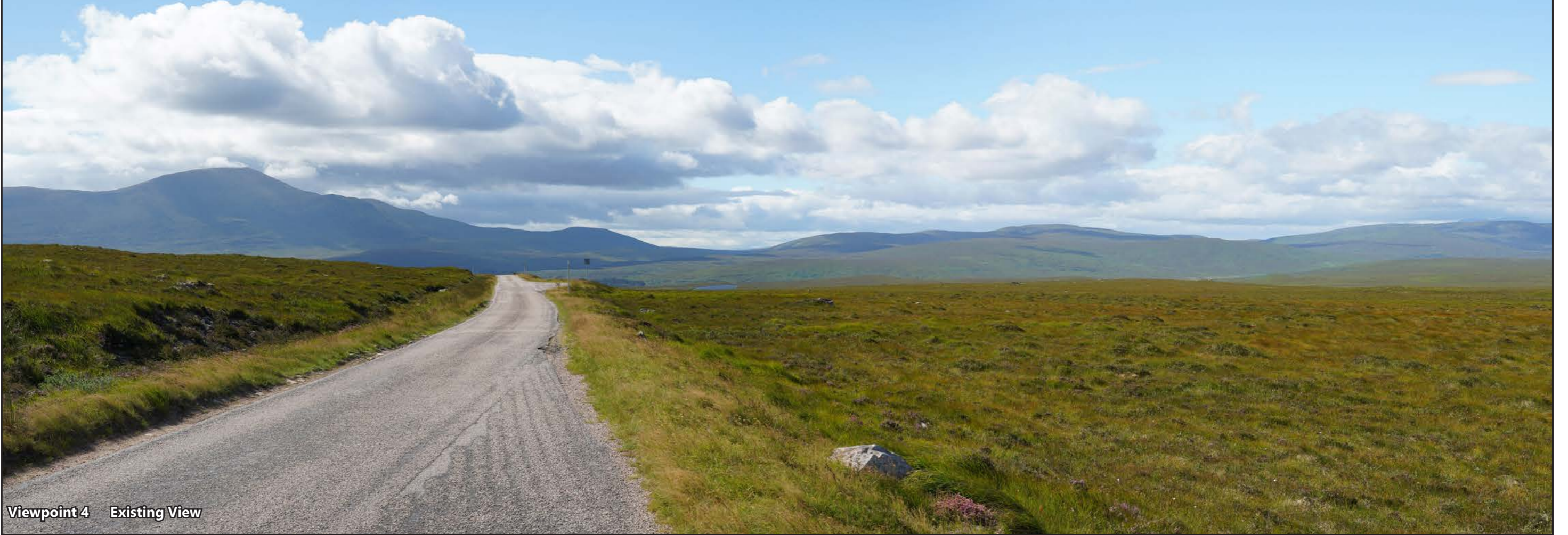
Viewpoint 4 Existing View