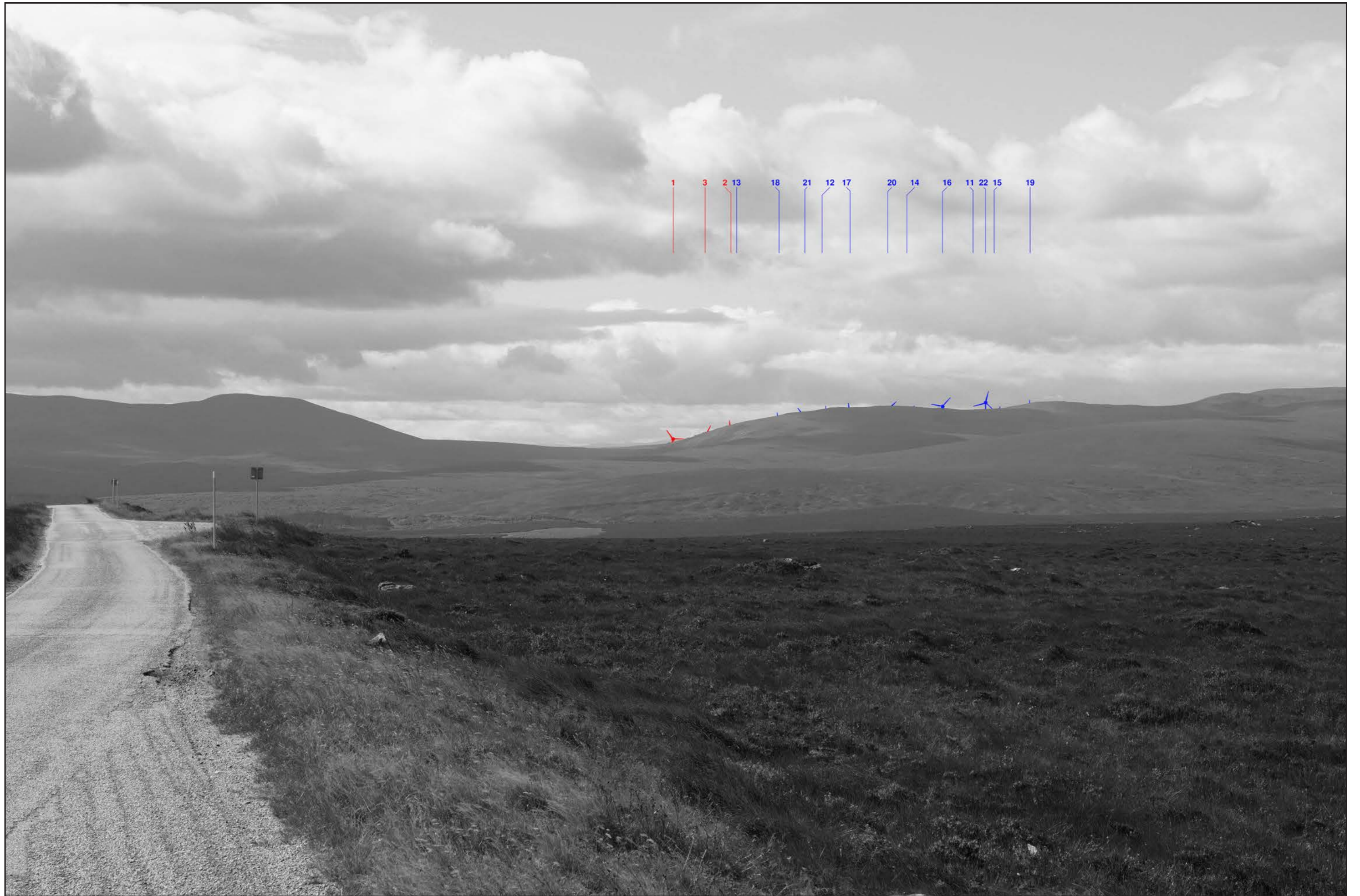
Viewpoint 4 (Fig 5.18k) - Monochrome Analysis A836 Southbound / NCN 1, South of Loch Staig

Distance to nearest turbine: 12,710m Camera: Sony ILCE-7RM3A Focal Length: 75mm Camera height: 1.5m Date: 08/09/2022 10:51