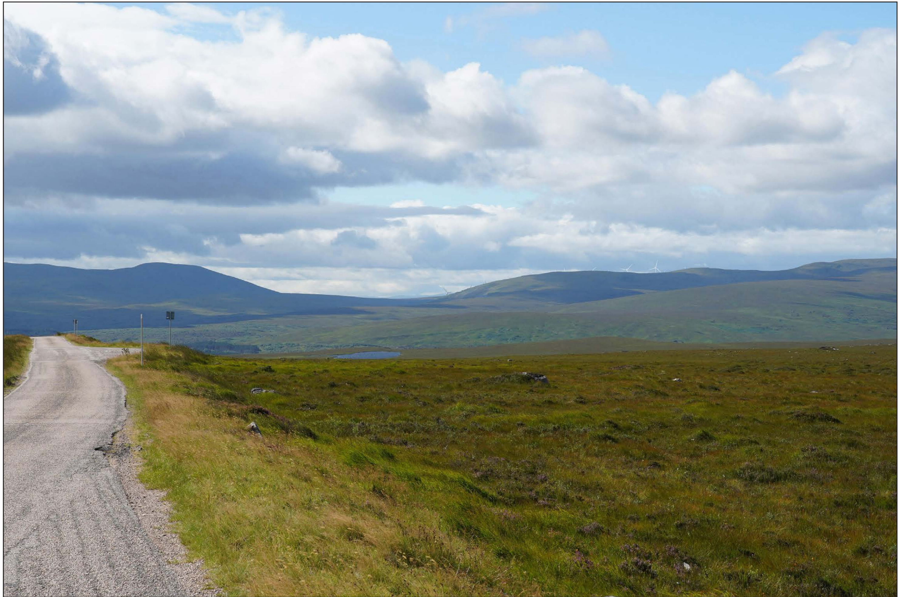
Viewpoint 4 (Fig 5.18j) A836 Southbound / NCN 1, South of Loch Staig

Distance to nearest turbine: 12,710m Camera: Sony ILCE-7RM3A Focal Length: 75mm Camera height: 1.5m Date: 08/09/2022 10:51