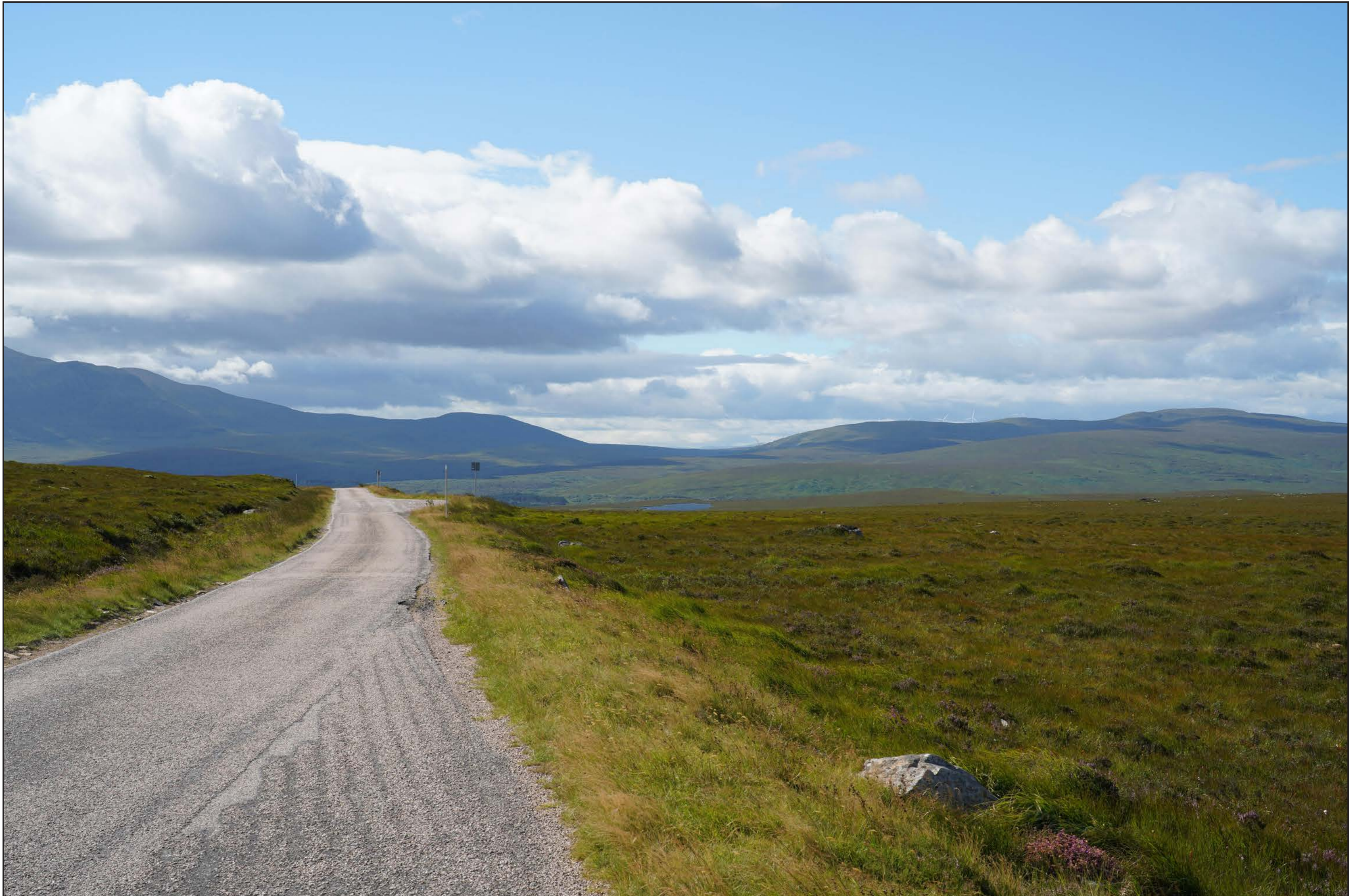
Viewpoint 4 (Fig 5.18i) A836 Southbound / NCN 1, South of Loch Staig

Distance to nearest turbine: 12,710m Camera: Sony ILCE-7RM3A Focal Length: 50mm Camera height: 1.5m Date: 08/09/2022 10:51