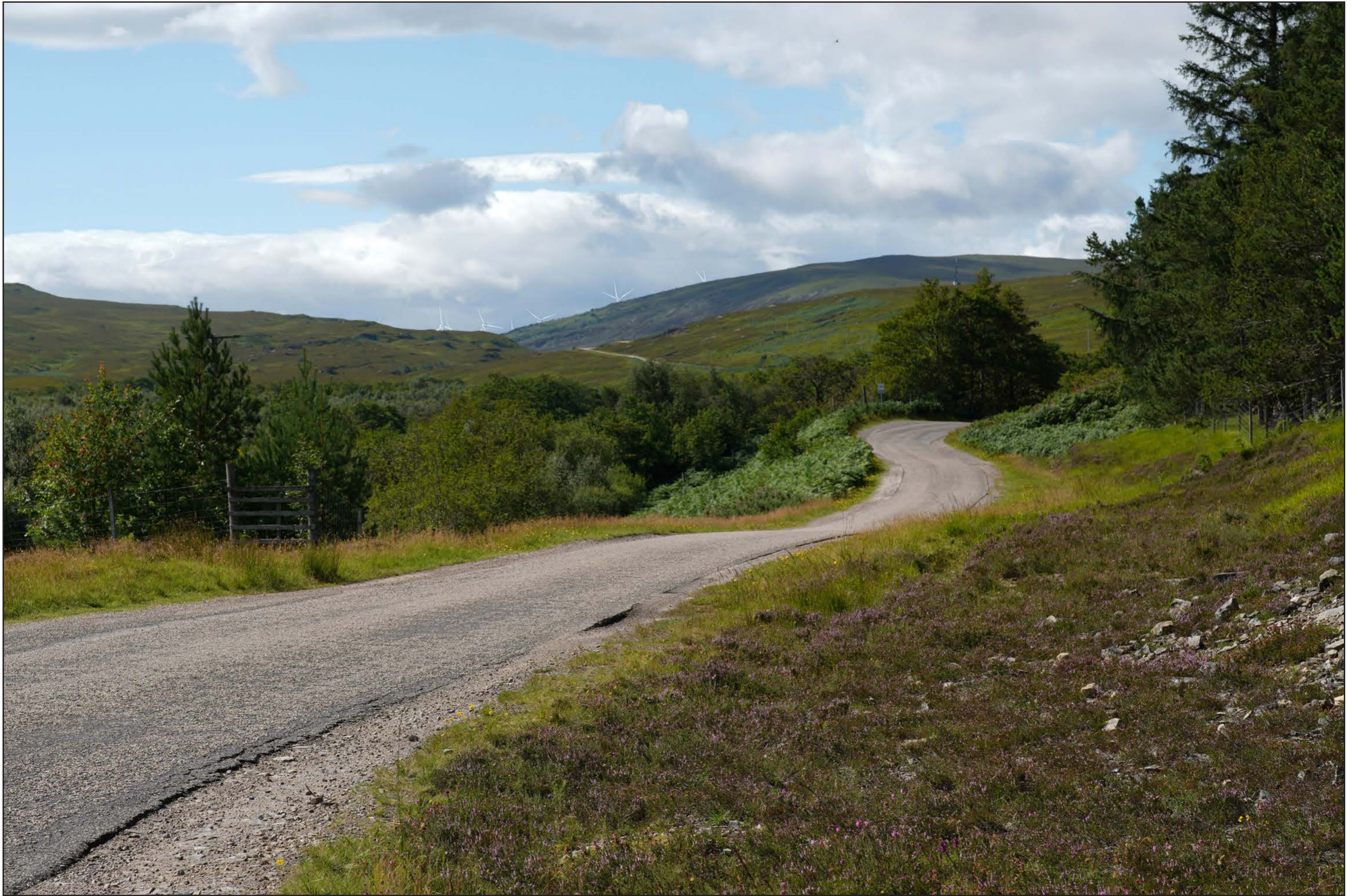
Viewpoint 1 (Fig 5.17j) A836 Southbound / NCN 1, South of Altnaharra

Distance to nearest turbine: 7,352m Camera: Sony ILCE-7RM3A Focal Length: 75mm Camera height: 1.5m Date: 08/09/2022 11:55