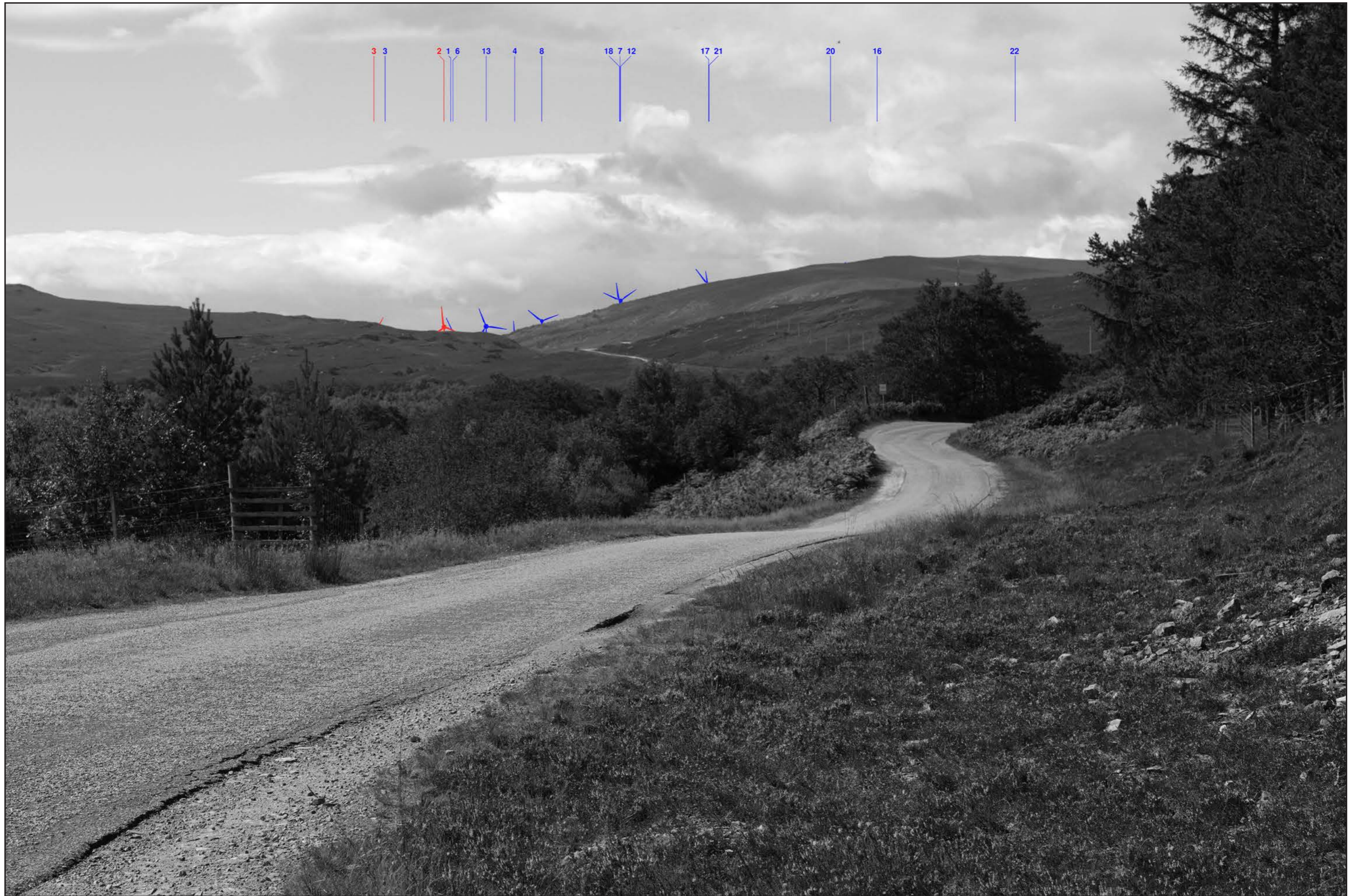
Viewpoint 1 (Fig 5.17k) - Monochrome Analysis A836 Southbound / NCN 1, South of Altnaharra