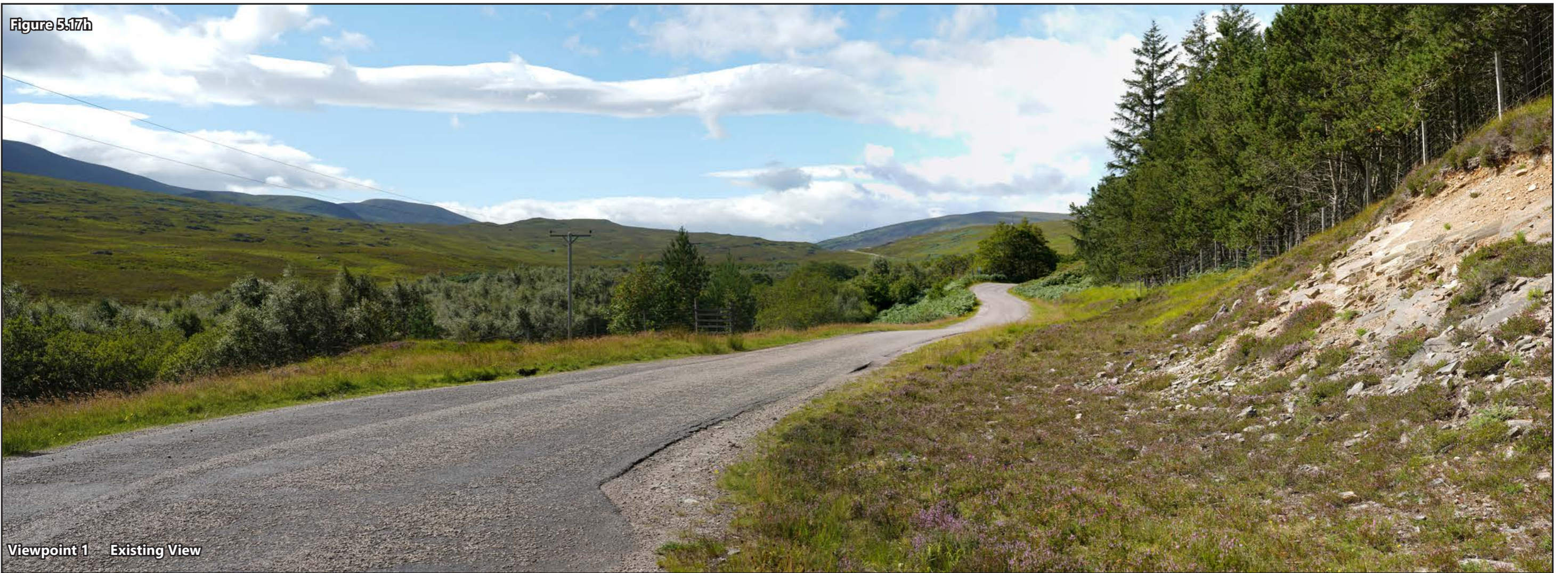
Viewpoint 1 Existing View