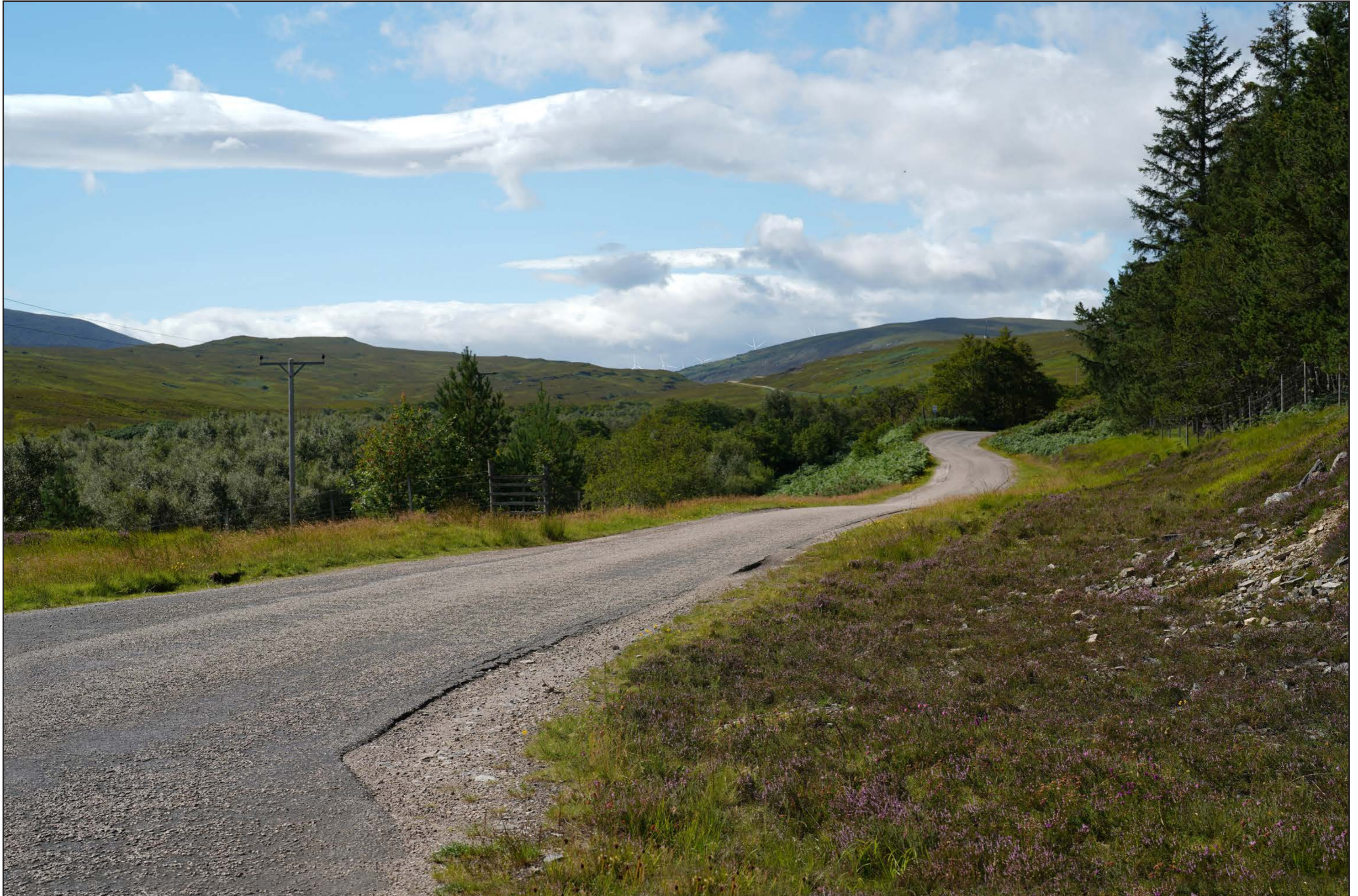
Viewpoint 1 (Fig 5.17i) A836 Southbound / NCN 1, South of Altnaharra

Distance to nearest turbine: 7,352m Camera: Sony ILCE-7RM3A Focal Length: 50mm Camera height: 1.5m Date: 08/09/2022 11:55