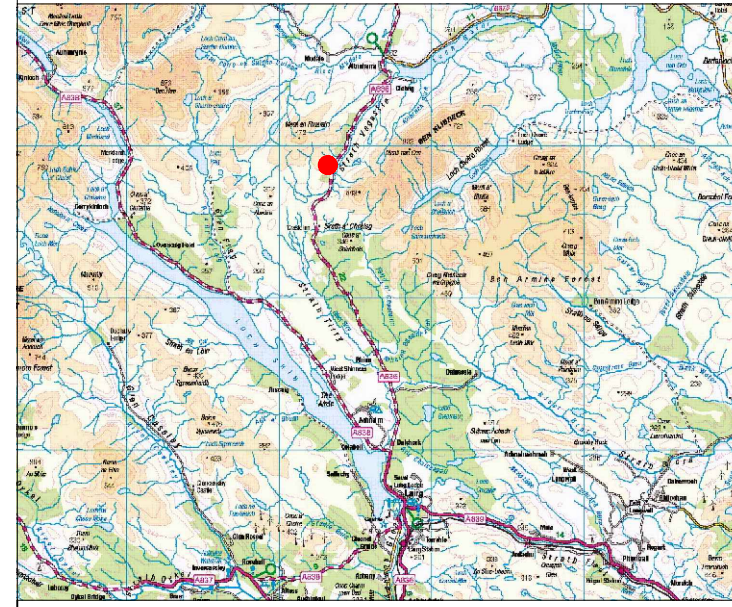
Map Scale 1:500,000